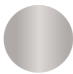
Precious Silver Pearl